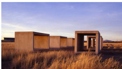
Donald Judd, 15 untitled works in concrete , 1980-1984, Chinati Foundation

The Chinati Foundation/La Fundación Chinati is a contemporary art museum based upon the ideas of its founder, Donald Judd. The specific intention of Chinati is to preserve and present to the public permanent, large-scale installations by a limited number of artists. Chinati's emphasis is on works in which art, architecture and the surrounding landscape are inextricably linked. The museum is located on 340 acres on the site of a former cavalry fort, Fort D.A. Russell. The collection currently comprises work by 13 artists, each installed in a separate building on the museum's grounds. In July 2016, a new installation by Robert Irwin opened, the first addition to the permanent collection since 2004.