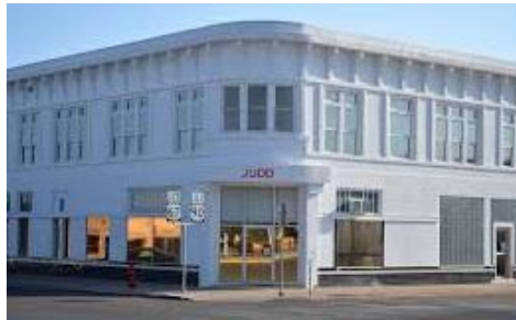
Judd Foundation, Marfa, TX