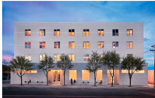
Hotel Saint George, Marfa, TX

The Hotel Saint George is a 55-room contemporary boutique hotel on Marfa's main street. It features 2 restaurants, a bar/lounge and outdoor pool and is the new home of The Marfa Book Company, a very special independent bookstore. Built on the site of an earlier Hotel St. George (1886-1929), the facility was designed by Houston architect Carlos Jimenez. Complimentary WiFi. Breakfast buffet is included and starts at 7:00 am.